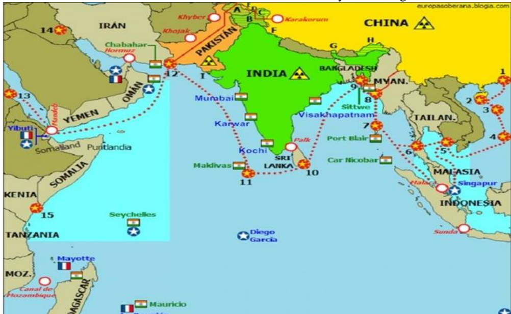
Figure 3: Pearl of String in IOR

China has planned economic and military development for the next 50 years, divided into three phases. The first Phase from 2000-2010 concentrated on economic activities, doubling GDP, and improving the capabilities of the Navy from Green Water to Blue Water. The second stage further doubled the GDP and development of 06 Aircraft Carrier groups from 2010-2020. As per the US Report of 2022 Chinese Naval units is expected to grow to 420 ships by 2025 and 460 ships by 2030. (O'Rourke, China Naval Modernization: Implications for U.S. Naval Capabilities, 2023) In the final stage of thirty years, spanning from 2020-2050 Chinese will be the largest economy and its navy powerful enough to project itself in all oceans, which is causing worries for US.