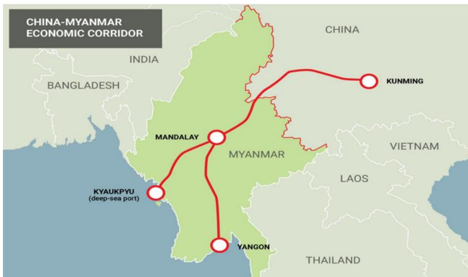
Figure 4: China-Myanmar Economic Corridor (CMEC)

The Indian Ocean is seeing a steady but significant increase in China's economic and military influence. The BRI/CPEC/CMEC (CMEC route is shown in Figure 3), military base, and ambition to be a global power reflect the Chinese strategy in the Indian Ocean. The US and its allies' task of containing China will be difficult, but they will be able to restrict its freedom of movement in the Indian Ocean.